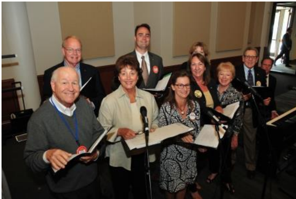
The Club 33 Singers brightened our day with songs.