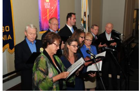
The Club 33 singers entertained the club before the program.