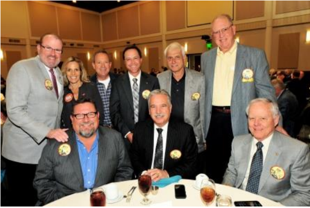
More SDSU alumni came out in support of the guest speaker.