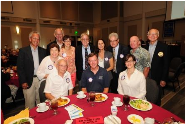
Staff, volunteers and board members from the San Diego Maritime Museum joined us for today's program about the history of the San Salvador.