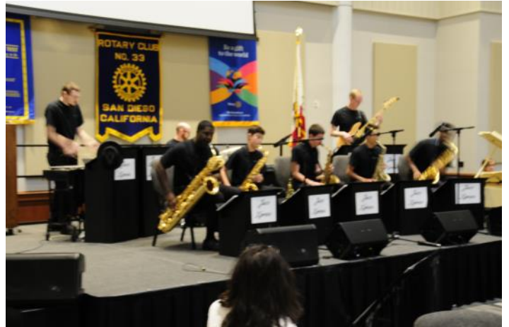
Thank you to all the very talented young men of Jazz Xpress who entertained us and kept our toes tapping during the program.