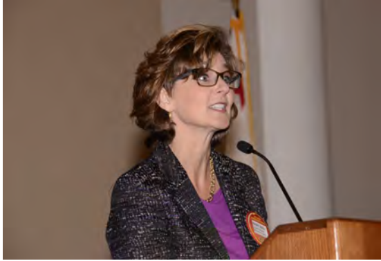
Pictured at left from top to bottom: