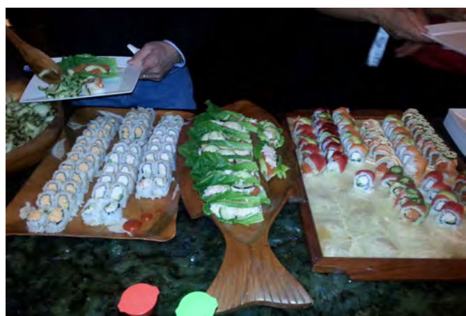
A feast of sushi at Christy White’s house