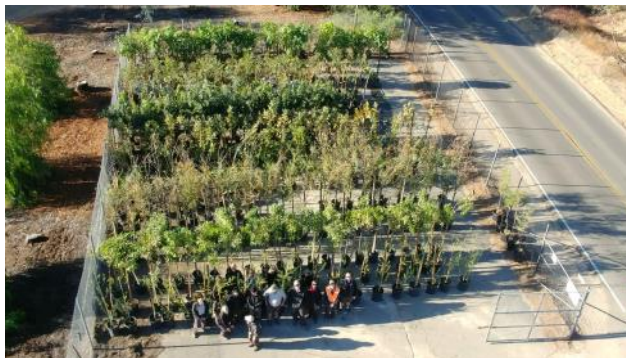
Pictured above: Our trees have arrived at the Safari Park!