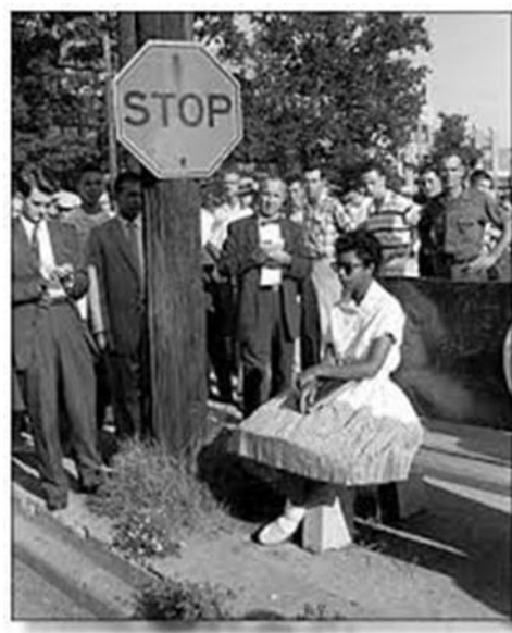
(Left) Elizabeth Eckford faces an angry mob as she tries to attend school; (right) Elizabeth the bus stop bench.