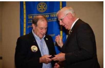
Congratulations to the 31 members who received a Paul Harris Fellow pin at our meeting. It's not often you get to have your pin presented to you by the President of Rotary International!