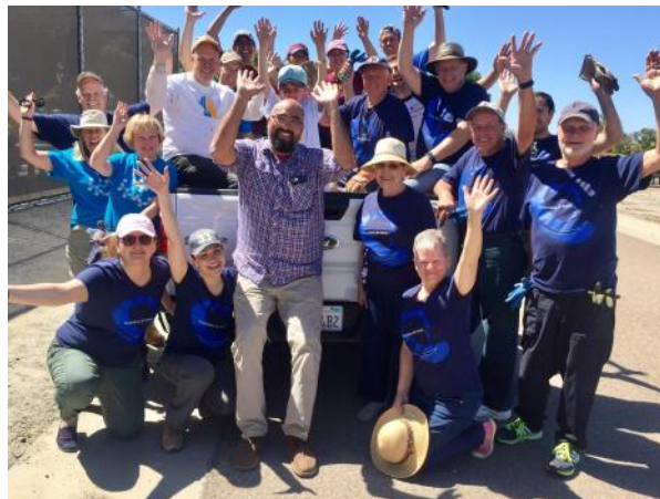
Rotarians At Work April 2017 - at Balboa Park Nursery