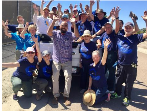
Rotarians At Work April 2017 - at Balboa Park Nursery