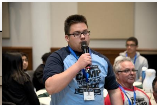
(Above) Students participated in Q&A with our guest speaker.