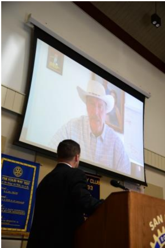
A first in Club 33 history! Guest speaker President Fox addressed the club remotely from Mexico City via Skype.