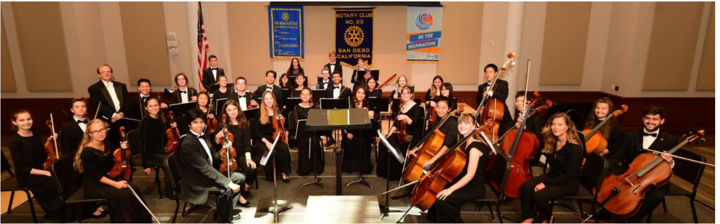
This summer's International Youth Symphony include students from Spain, Ireland, Croatia, Taiwan, Switzerland, Germany, UK, Poland, Canada, Romania and Italy.