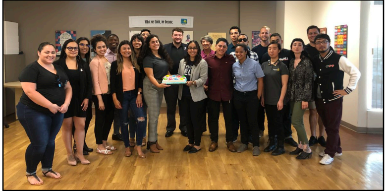
(above and below) Members celebrated CHR's fourth birthday with an annual tradition, enjoying some birthday cake! A great way to kick of the 2019-2020 year.