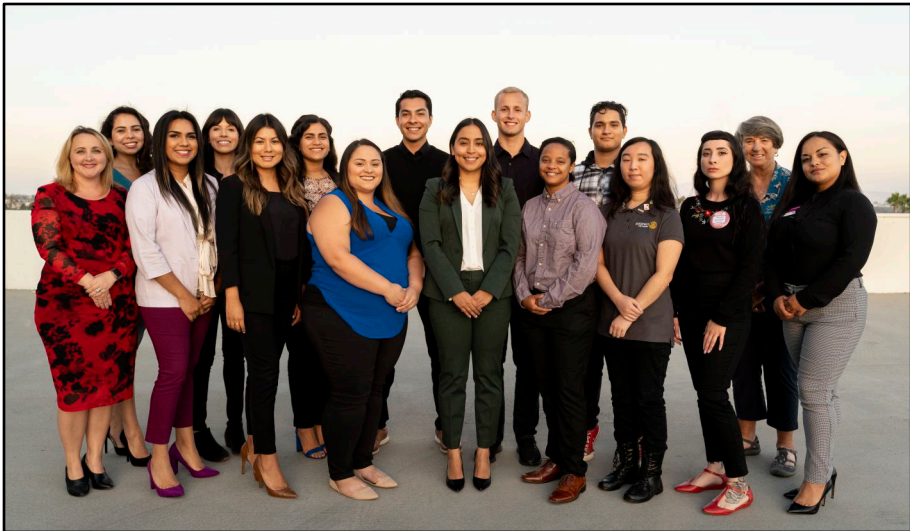
City Heights Rotaract Club, 2019-2020