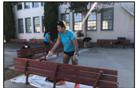
(above and right) City Heights Rotaract kicked off the month of August by participating in the annual Hoover Beautification Day with the Alumni Association and current Hoover students ... a lot of painting took place!