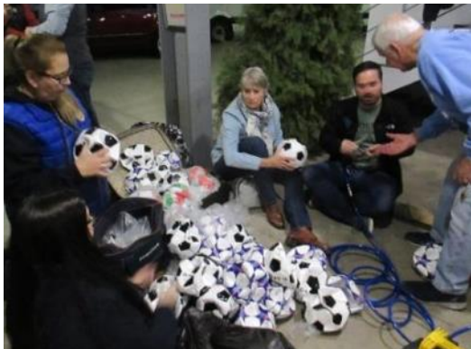
(Left) Rotarian volunteers fill soccer balls with air; (right) then our young volunteers handed them out to grateful families.