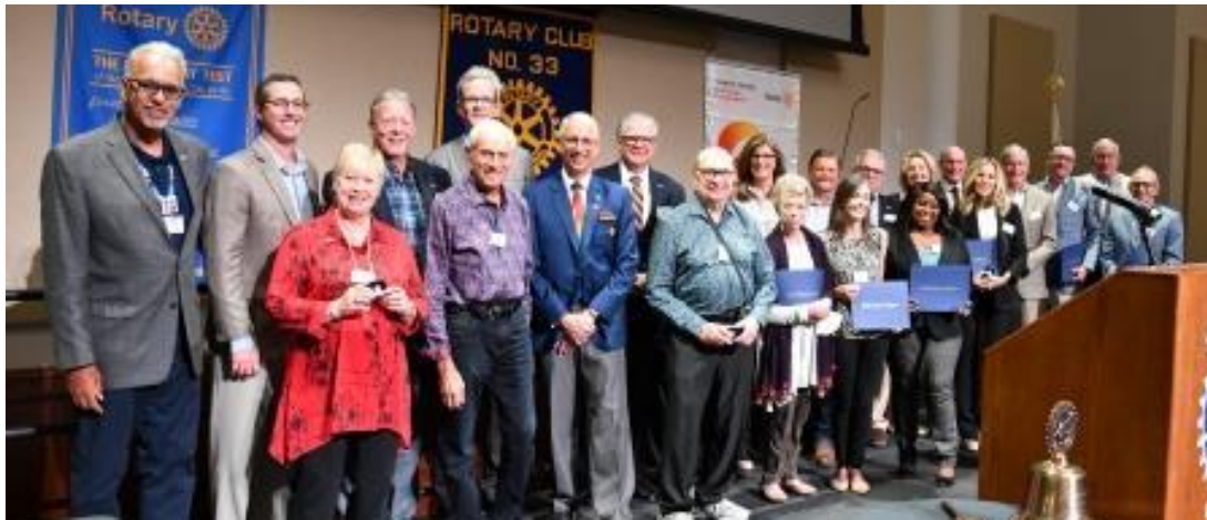
Paul Harris Fellows awarded pins and certificates.