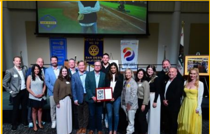
(Lt.) Surprise guest speaker, San Diego Padres starting pitcher, Joe Musgrove. (Rt.) San Diego Padres organization.